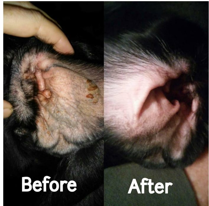
Figure 3: BEFORE and AFTER pictures of dog’s ear, showing marked improvement and return to health.

Ms. Kay volunteers that it's extremely important to her that the product is all natural and is impressed at not only how effective EcoEars is but how affordable the product is as well. She added, “I use nothing but EcoEars for all my dogs now on a regular basis for ear cleaning. EcoEars is keeping my 5 dogs happy and healthy.’