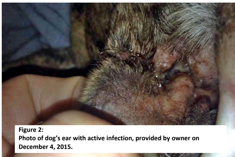
Figure 2: Photo of dog's ear with active infection, provided by owner on December 4, 2015.